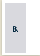
B. 2/3 PAGE VERTICAL 4 1/2" (w) x 10" (h)