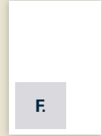
F. 1/3 PAGE SQUARE 4 1/2" (w) x 4 7/8" (h)