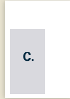
C. 1/2 PAGE ISLAND 4 1/2" (w) x 7 1/2" (h)